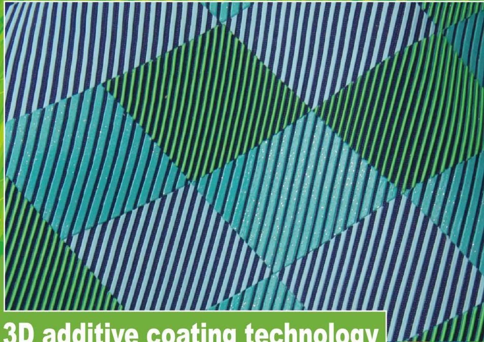
3D additive coating technology